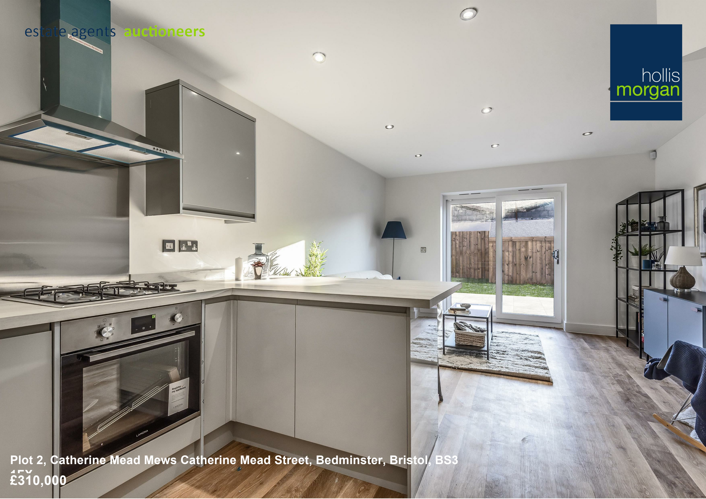
Plot 2, Catherine Mead Mews Catherine Mead Street, Bedminster, Bristol, BS3 15V £310,000